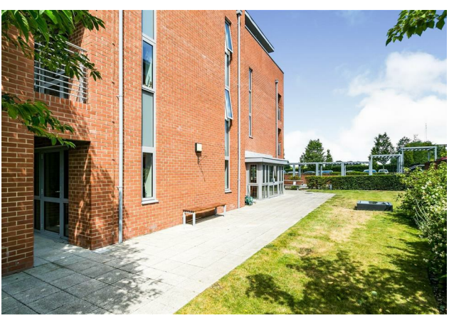
EX SHOW APARTMENT - GROUND FLOOR